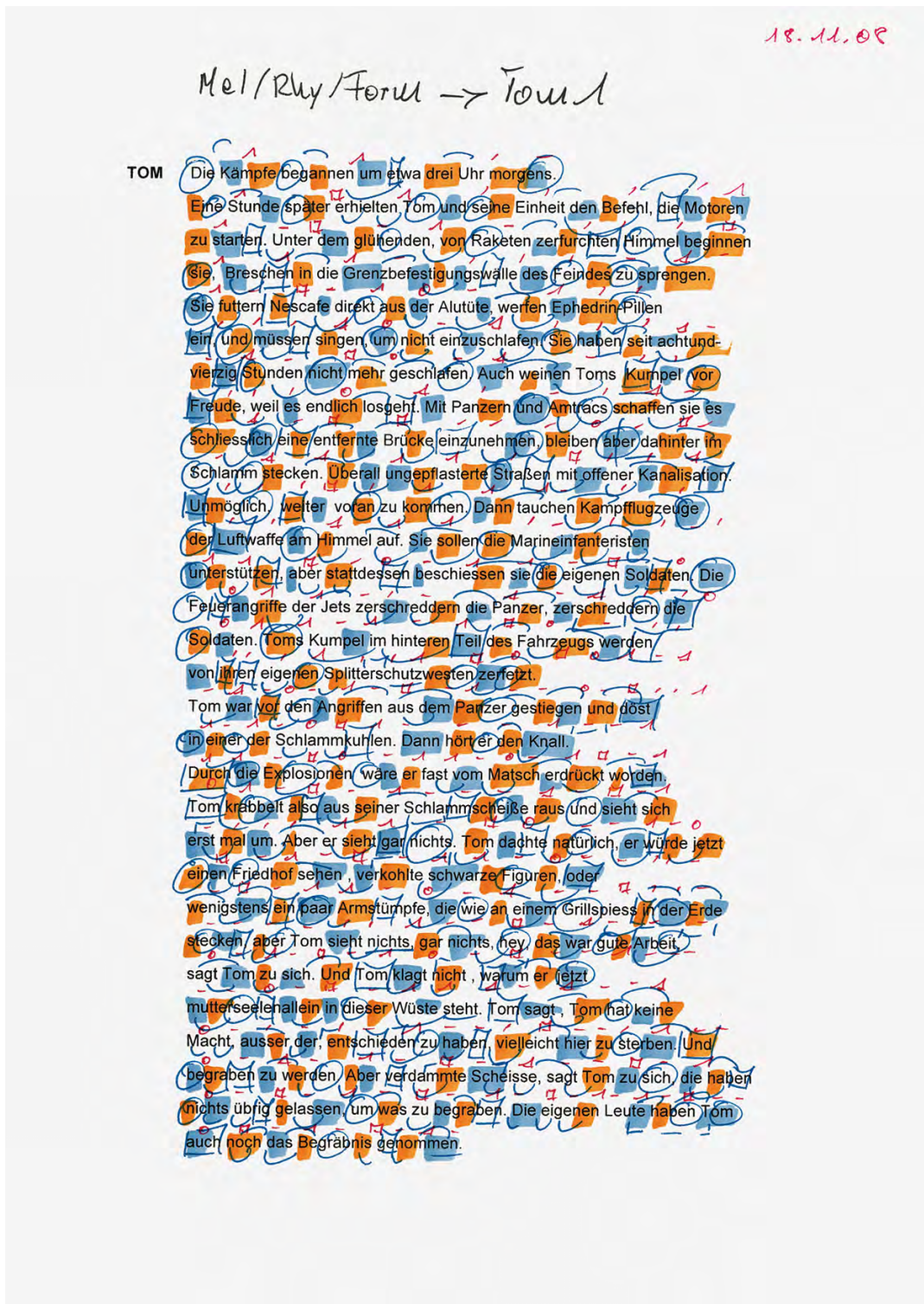
Sketch for "Mein Bruder Tom", Theatre music, Tübingen 2008 (21 x 30 cm)