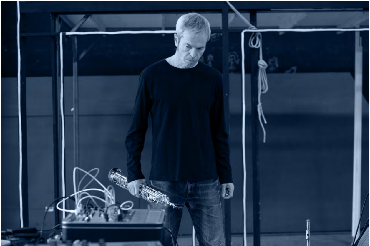
Recordings for "Soprano/Synth/Tape", Munich 2021